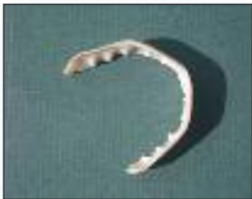
The Imako Cosmetic Teeth® are the thinnest, most comfortable temporary teeth.

If you have no side teeth at all, bond two or three beads along the bottom edge where you have teeth and fold the material around the back side. Press it out to be very thin so it is flexible. This may obstruct closing your teeth.